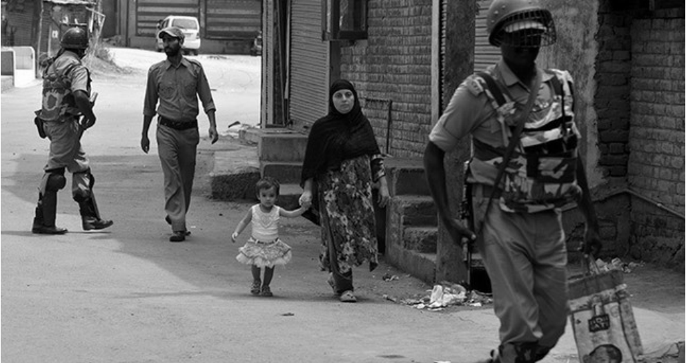
Indian soldiers enforce curfew in Kashmir

Neither nation faces an imminent break-up, but in both there are increased centrifugal tendencies. The measures against residents of Assam echo the Windrush scandal in Britain, in which thousands of people who had lived in the country since early childhood lost jobs and access to healthcare, and were even deported if they could not prove they had lived in the UK all their lives. It’s a similar story with the deportations of undocumented migrants in the USA. There have been increased murders of people accused of killing cows in India, murders of those accused of blasphemy in Pakistan, just as there were increased xenophobic attacks in Britain after the Brexit vote.